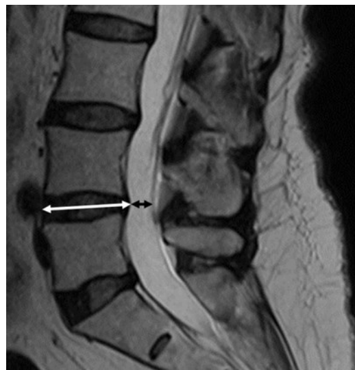
Figure 1. Modified Torg-Pavlov ratio (mTPR). White arrow depicts antero-posterior diameter of intervertebral disc (AP IVD ). Black arrow depicts antero-posterior diameter of dural sac (AP DSC ) (Department of Neurosurgery, Cantonal Hospital Zenica, 2023)

All patients received preoperative lumbar spine magnetic resonance imaging (MRI; Magnetom Avanto 1.5 T, Siemens, Erlangen, Germany) to detect the vertebral level, dominant side of LSS, presence of intervertebral disc degeneration, dural sac compression, foraminal stenosis, or facet joint degeneration. Morphometric analysis included measuring the anteroposterior diameter of the intervertebral disc (AP IVD ) and dural sac (AP DSC ), expressed in mm, to determine the modified Torg-Pavlov ratio (mTPR) (Figure 1) using the relation mTPR = AP_{DSC} / AP_{IVD} .