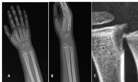
Figure 1. The x-rays done 7 days from the beginning of the symptoms show an osteolytic area at the distal metaphysis of the right radio. No clear rim is present around the lesion. A) anteroposterior view, B) lateral view, C) magnification of the lesion (Rinonapoli G, 2016)

A three-year-old Caucasian boy underwent an orthopaedic examination because of persistent pain at the right wrist. The patient was prescribed paracetamol, which temporarily reduced the symptomatology. After 7 days, pain was still present. For this reason, the boy was submitted to plain x-rays of the right wrist, which showed an osteolytic area, with poorly represented bone rim (Figure 1). This finding caused concern to the physicians and natural anxiety to the patient's parents. The paediatrician had the patient take some hematologic exams and the orthopaedic surgeon suggested a magnetic resonance (MRI) with con-